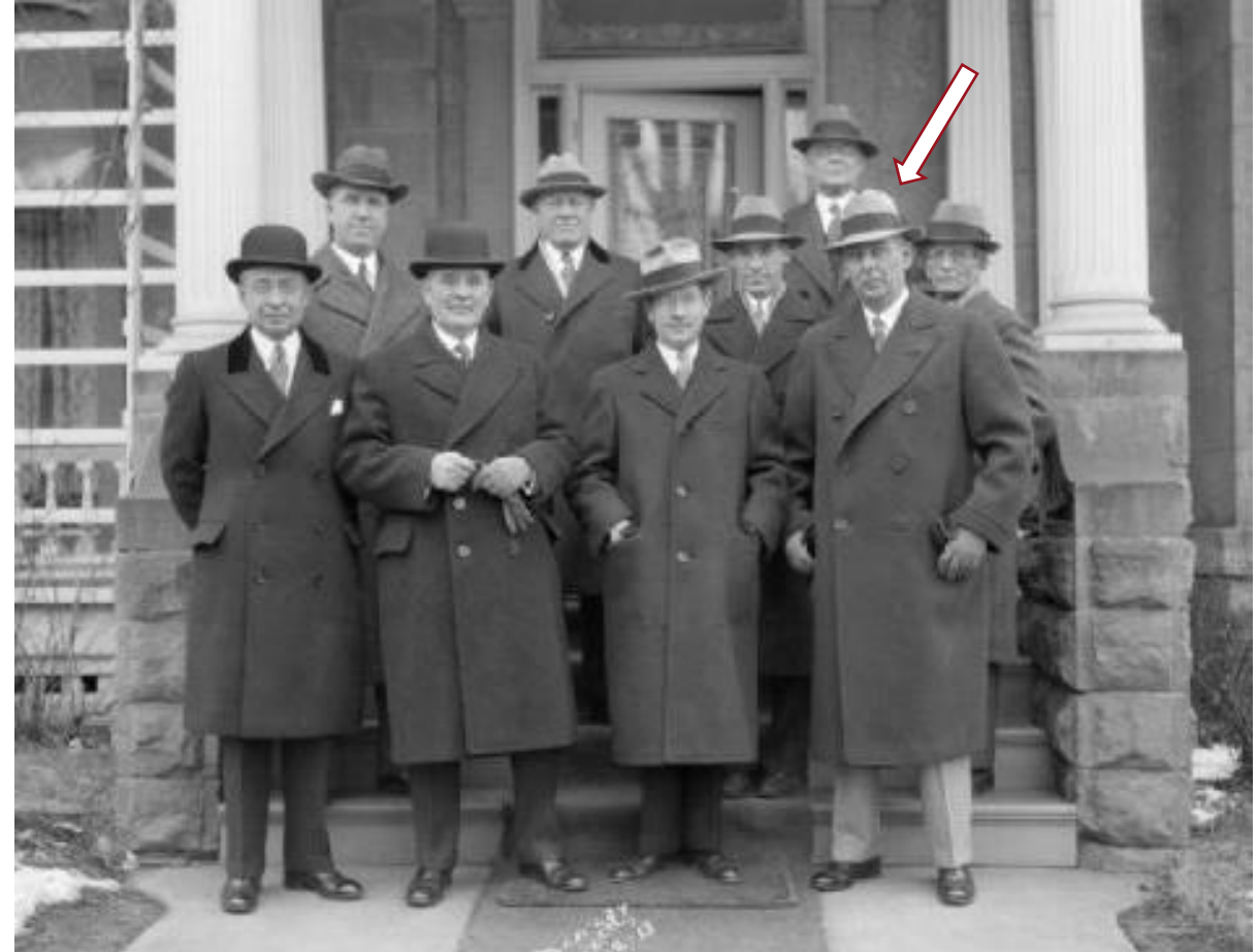
Portrait of Governor Philip La Follette and eight industrialists standing in front of the Governor's Residence, January 1931.